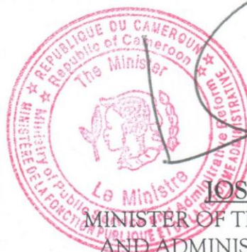
JOSEPH LE MINISTER OF THE PUBLIC SERVICE AND ADMINISTRATIVE REFORM