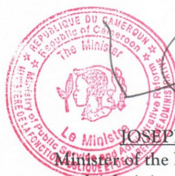
JOSEPH LÉ Minister of the Public Service and Administrative Reform