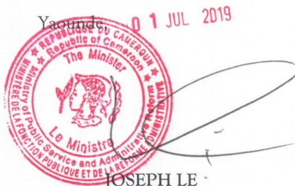
JOSEPH LE Minister of the Public Service and Administrative Reform