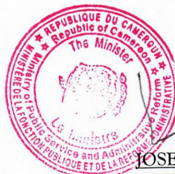
JOSEPH LE MINISTER OF THE PUBLIC SERVICE AND ADMINISTRATIVE REFORM